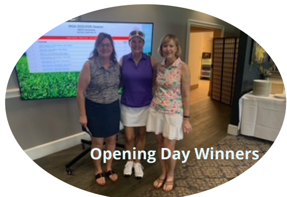
Opening Day Winners